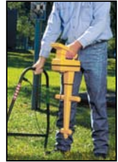
3M™ Dynatel™ Cable/Pipe and Fault Locator 2273M

The receiver also accommodates four user-definable auxiliary frequencies and allows the user to perform a self-calibration operation at any frequency at any time. With the easy-to-use configuration tool, users can enable or disable any of 22 frequencies.