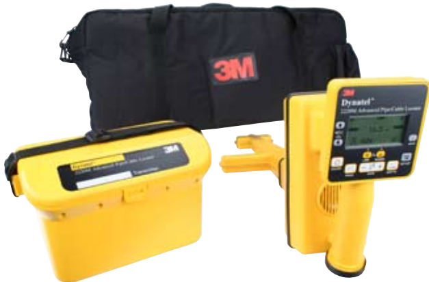
3M™ Dynatel™ Advanced Pipe/Cable Locator 2220M

When you choose a quality 3M Dynatel locator, you get outstanding performance and reliability, along with a 24/7 technical support and a service center dedicated to excellence. Our service center provides calibration, repair, upgrades and modifications for safety, performance and reliability.