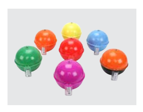
3M™ ID Ball Markers