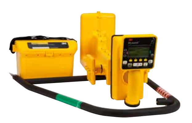
3M™ Dynatel™ Cable/Pipe/Fault/EMS Locator 7500 Series

When you choose a quality 3M^{\bowtie} Dynatel ^{\bowtie} Locator, you get outstanding performance and reliability, along with toll-free technical phone support and a service center dedicated to excellence. Our service center provides calibration, repair, upgrades and modifications for safety, performance and reliability.