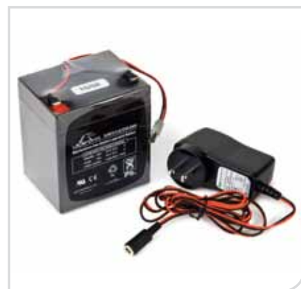
3M™ Rechargeable Battery 2200RB