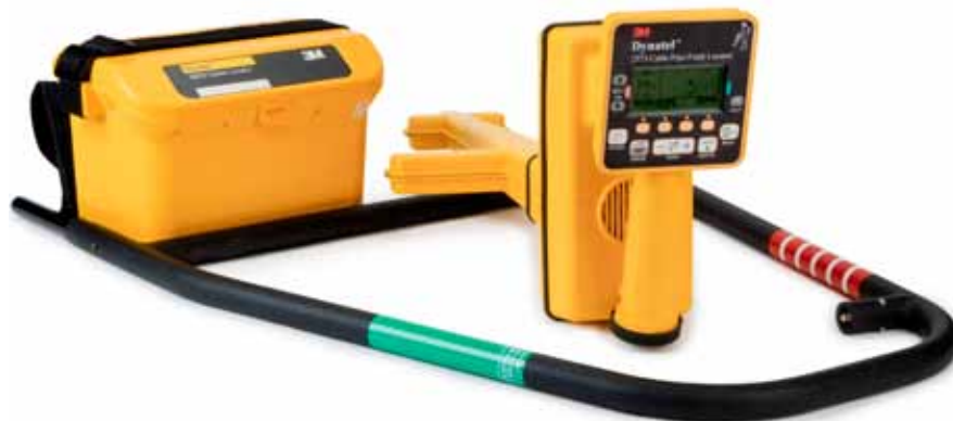
3M™ Dynatel™ Pipe/Cable Locator 2500 Series

As with all 3M™ Dynatel™ Locator products, the 2500 series provides accurate pipe, cable or Sonde depth measurements, giving a digital readout in feet and inches, or centimeters (user-selectable). Lightweight, compact and well-balanced, these cable and pipe locators allow you to accurately and easily locate your underground plant and assets. The 3M™ Dynatel™ 2550-iD and 2573-iD have the additional capability to locate all standard electronic markers and to write, read and lock programmed information into 3M™ Electronic Marker System iD Markers. All 2500 series locators and fault finders are also compatible with select GPS/GIS field mapping instruments for real time mapping of electronic markers or pipe and cable facilities. Other user friendly features include the ability to enable or disable receiver frequencies and the ability to select audio sounds in the simple menu driven interface.