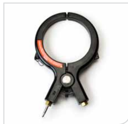
New 4.5 inch Dyna-coupler 4001 Standard on Utility Style Kits